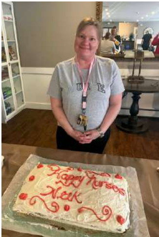
Mother's Day Social Nurses Week Celebration