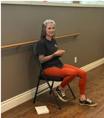
Chair Yoga - June 29th