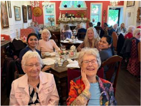
The O'Connor House