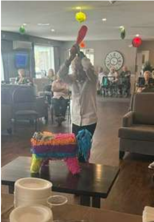
Cinco de Mayo