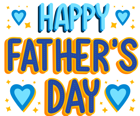
Father's Day Day Social Live Entertainment June 18