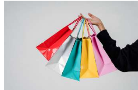
Quinte Mall Shopping Trip June 4