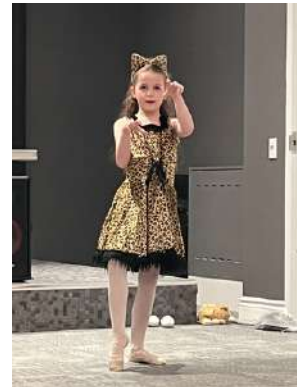
County School of Dance - June 9 th