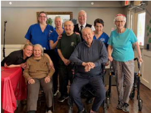
March Birthday Celebration