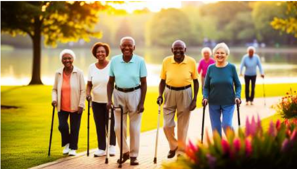
Walking Group April 14