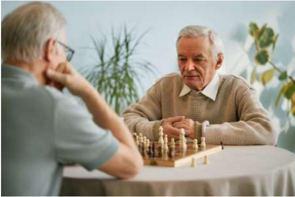
Men's Social April 15