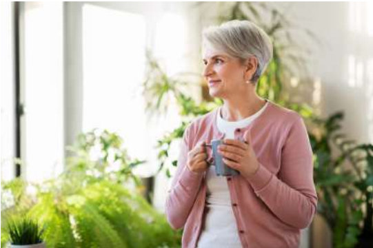
Easter Tea April 2