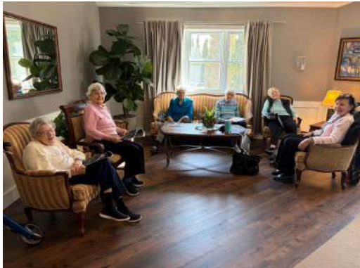
Emmanuel Baptist Bible Study