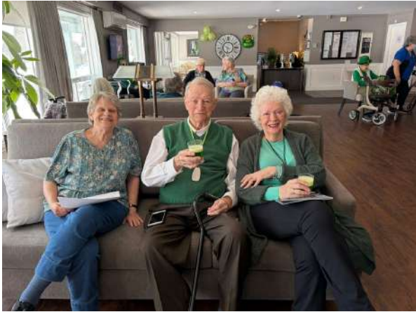
St Patrick's Day Party