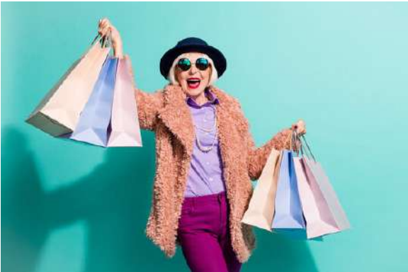
Trip To Walmart April 16