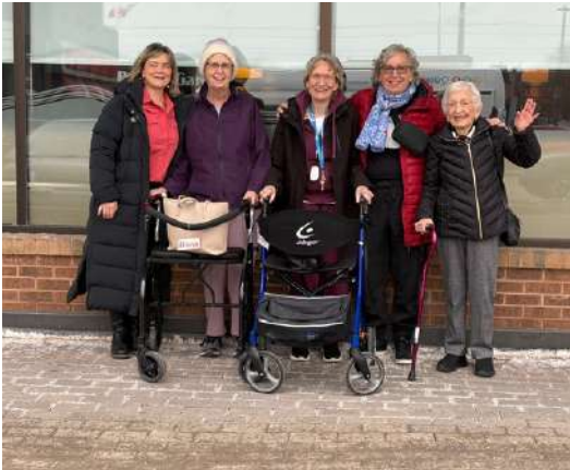
Chinese Buffet Trip