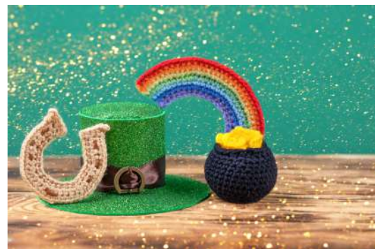
St Patrick's Day Social March 17 2pm