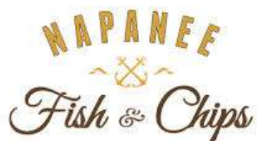
Fish & Chips Luncheon March 19 th