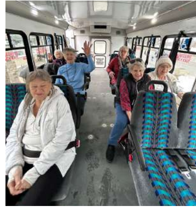
Quinte Mall Shopping Trip