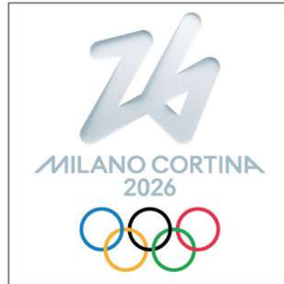
Olympics Reflection March 25 th