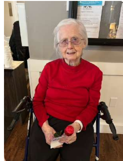
Valentine's Day Social