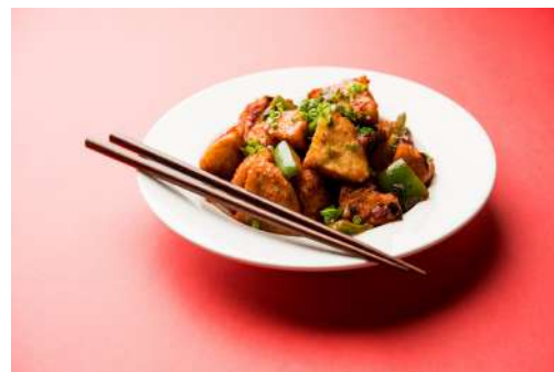
Chinese Buffet Luncheon March 26 th