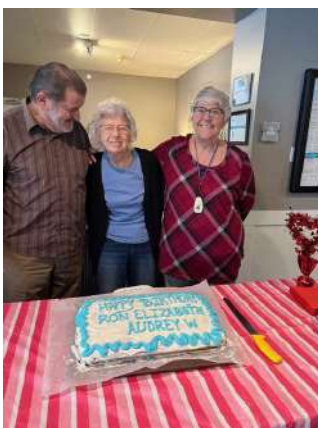
February Birthday Celebration